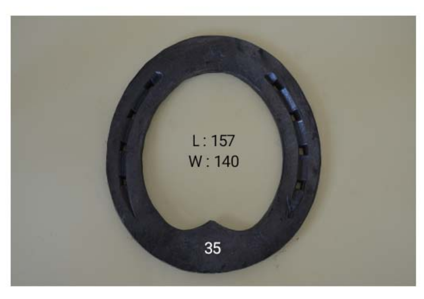
One paire of manufactured shoes N°5 - nails E5 slim