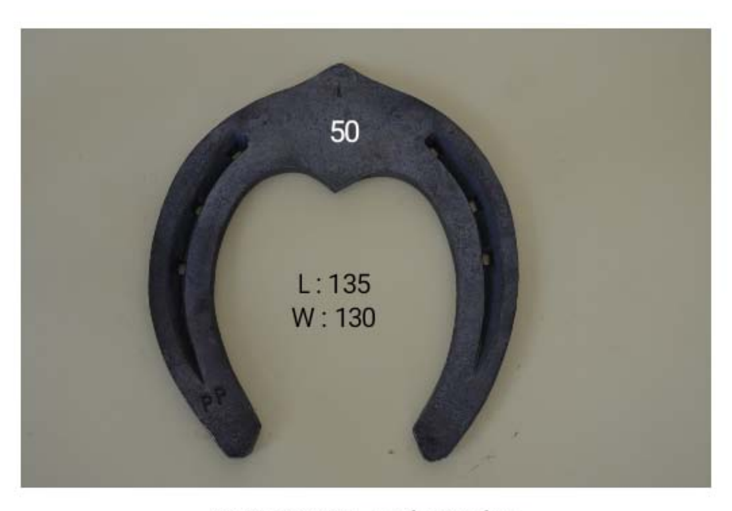
25 X 8 X 280 - nails E 5 slim