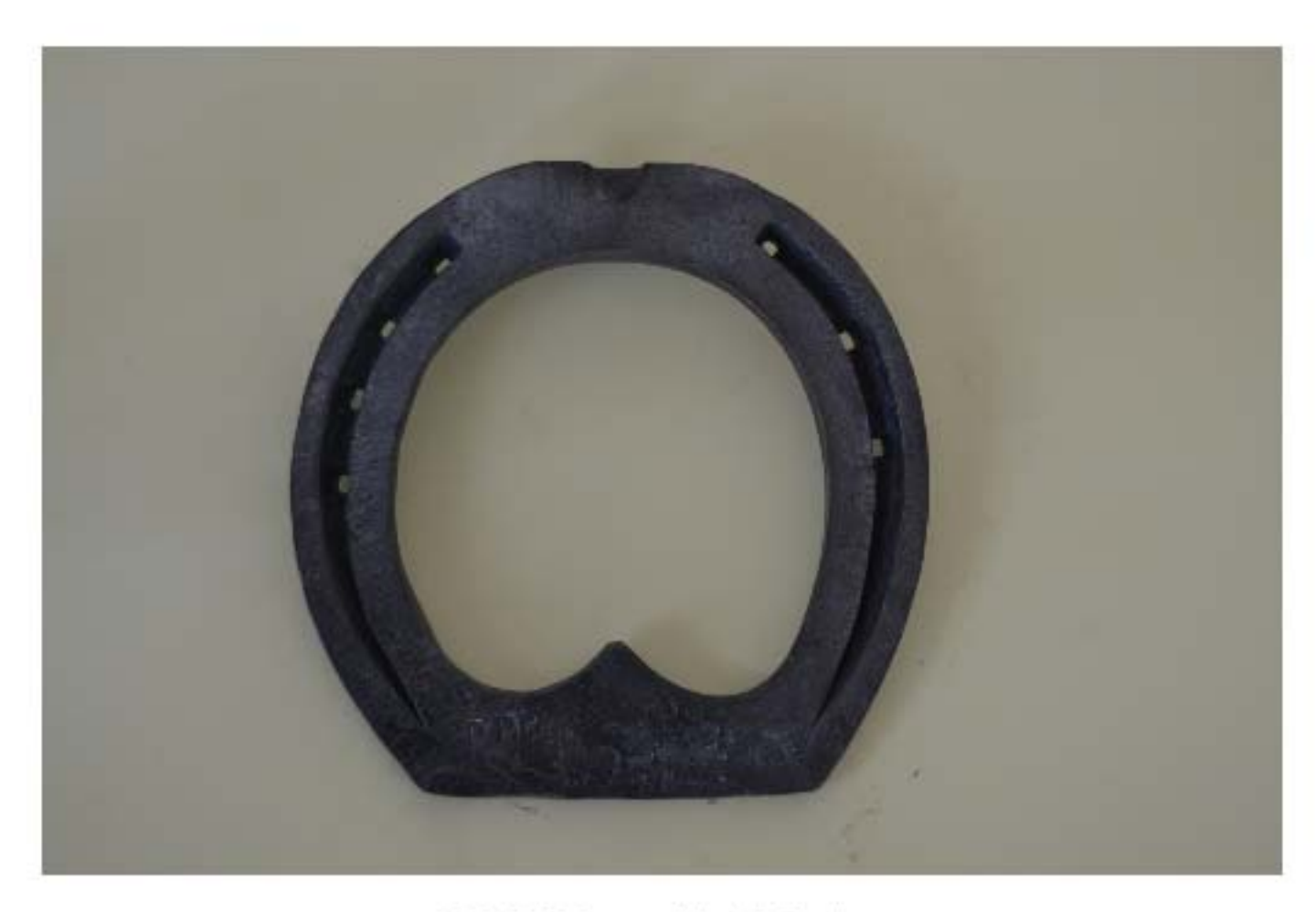
20 X 10 - nails E4 slim